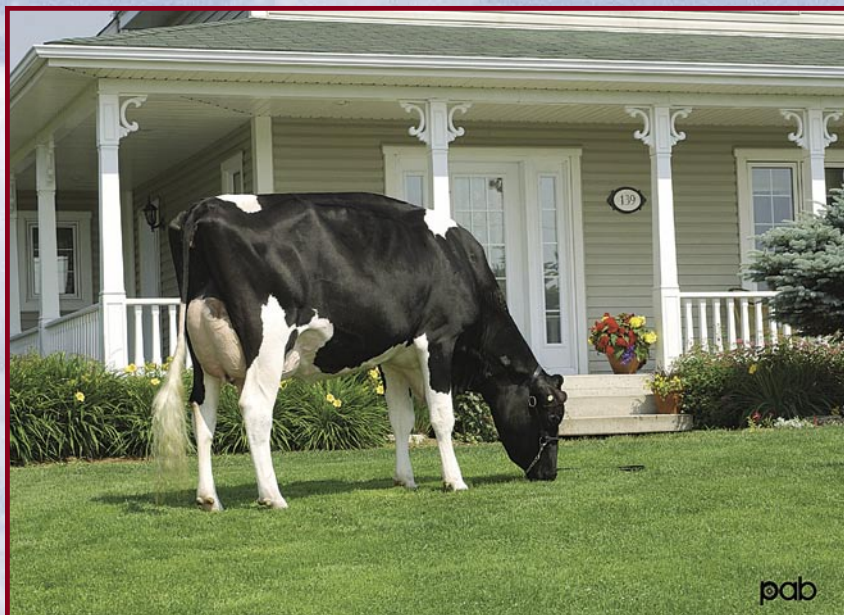
DAM: KARONA EMERSON BONNIE EX-92-CAN 3*

3 lactations : 45,716 4.5% 2,062 3.6% 1,660 kg